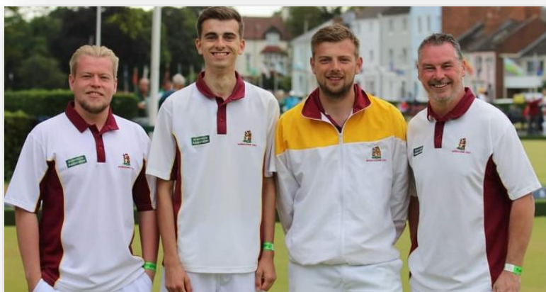
Our national fours semi-finalists, Bowls England National Championship Finals, Royal Leamington-Spa, 2021